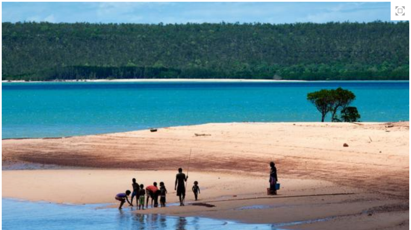
Aboriginal Australians fishing in the sea