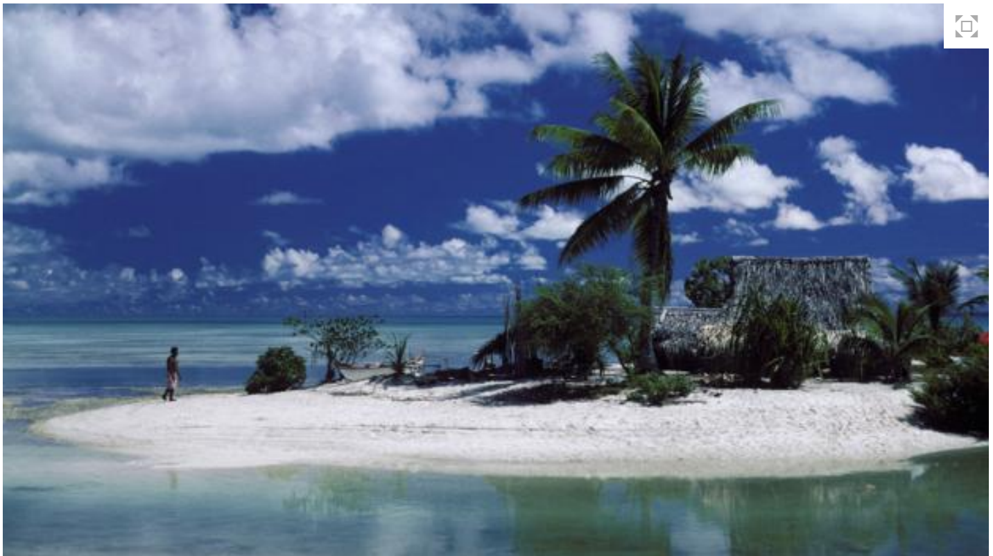
Kiribati is at risk from rising seas

In aboriginal and Pacific Island communities, some members of the younger generation are not learning their native languages and they are less interested in cultural traditions.