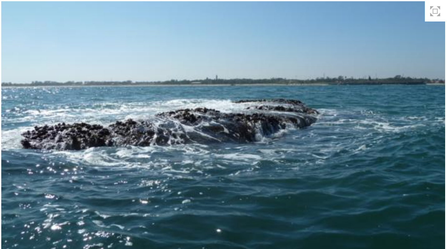
One of the submerged temples at Mahabalipuram

But Nunn believes that tsunamis alone don't account for the submergence and subsequent abandonment of such cities.