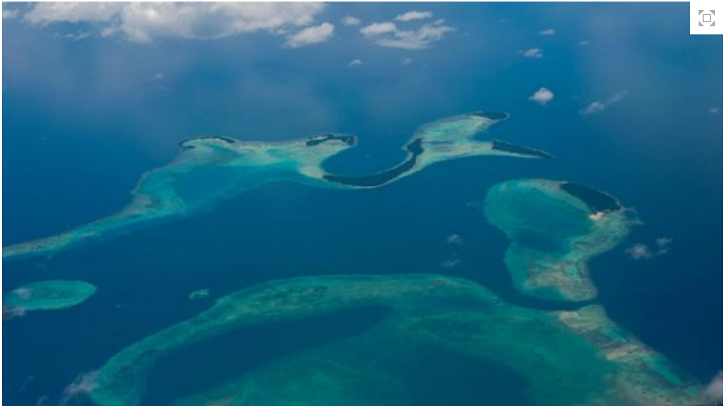
The Solomon Islands have lost a member

Nunn interprets the waves in the story as a description of a tsunami train – many tsunamis consist of a series of waves. "But of course, waves can't wash away islands, particularly islands that are high and volcanic," Nunn says.