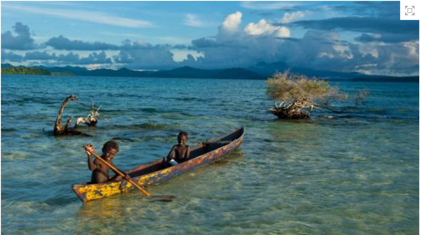
Solomon Islanders tell tales of sunken lands

When Nunn heard the story of another lost island, Teonimanu in the Solomon Islands of the South Pacific, he was instantly intrigued. "It was high land, it wasn't a low atoll or reef island just made of sand that could be easily washed away," Nunn says. "It was a substantial island that disappeared."