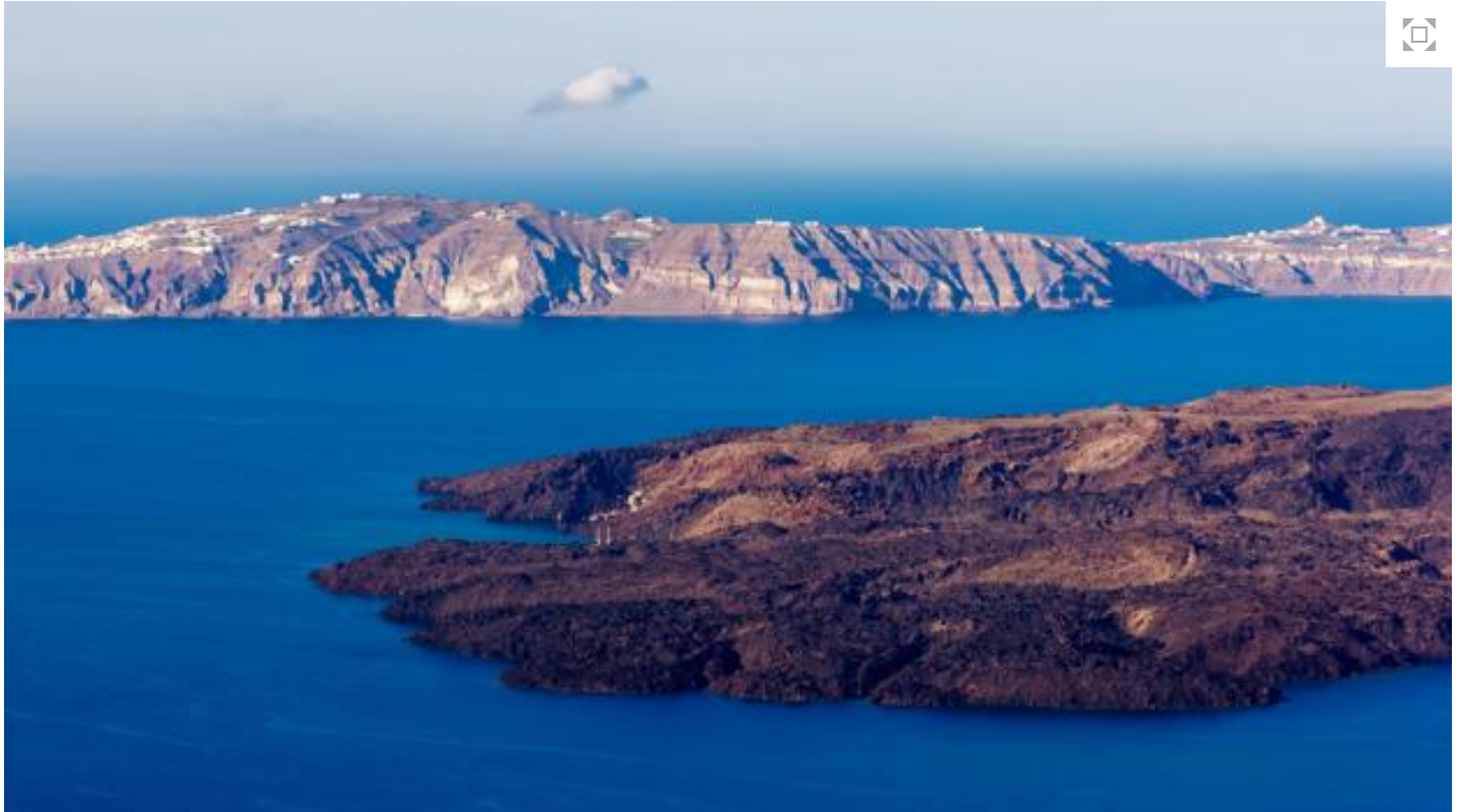
Santorini is a huge volcanic caldera