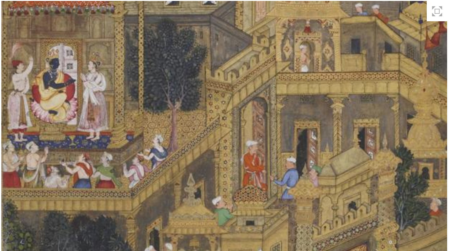
"Lord Krishna in the Golden City", from the Harivamsa, ca. 1600

In fact, there is still some scientific scepticism about the ability of entire islands to slip beneath the sea in the way that Nunn thinks Teonimanu did. But Nunn points out that the volume of material in an island such as Teonimanu is still a lot less than the amount that moves in large terrestrial landslides.