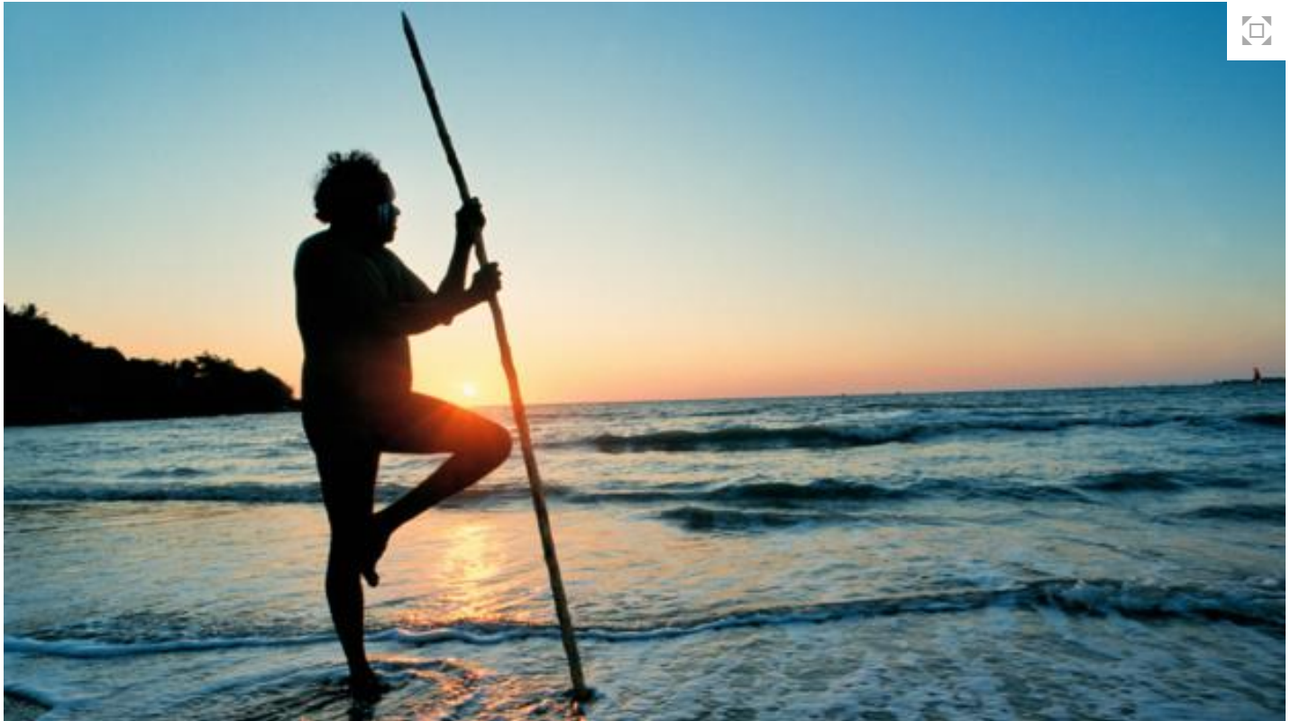
Legends of sea level rise have endured in Australia

Aboriginal societies have probably existed in Australia for around 65,000 years, isolated until the European colonisation in 1788. Australia was undoubtedly a hard environment to live in, and survival through the generations depended on passing down information about food, the landscape and the climate from one generation to another.