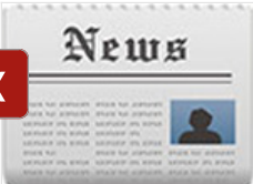
Search on for 3rd day in Chicago dismembered-toddler case