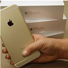
iPhone 6 Plus's Being Sold for Next to Nothing LifeFactopia

Celebs you didn't know passed away: #1 is Shocking Your Daily Dish