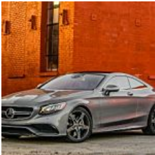
10 Best Cars of 2015 Drive Across the Spectrum Kelley Blue Book