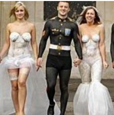
You Have To See These Hilarious Wedding Photos Inside Grind