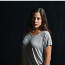
Here's Why You Should Stop 'Googling' Names BeenVerified.com